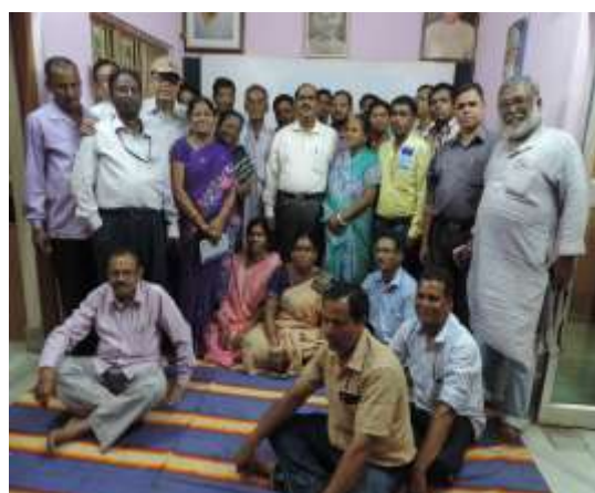
DLNCC MEETING PHOTO