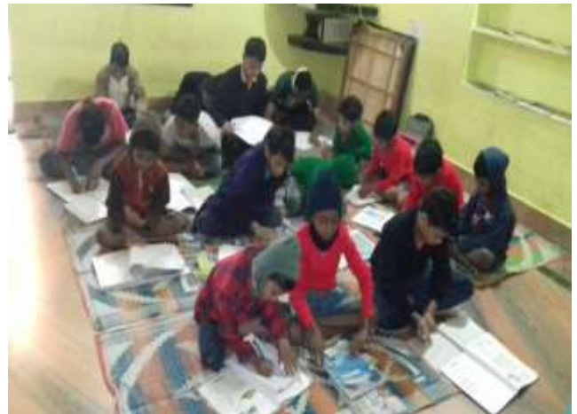
STUDY TIME HOTO