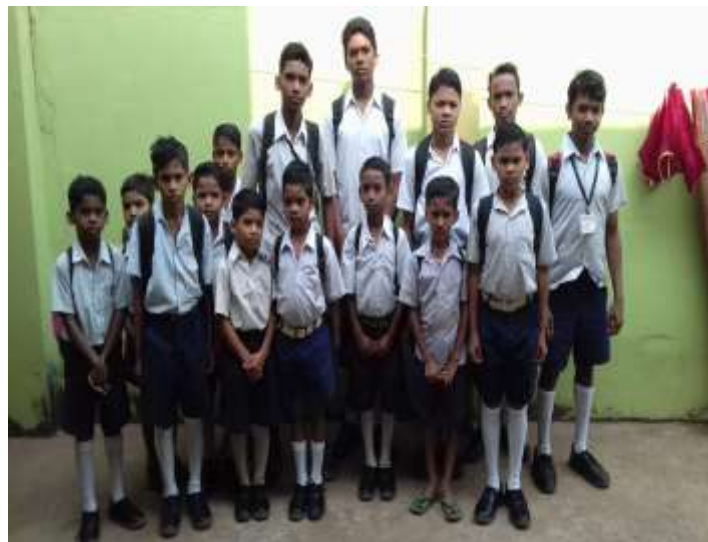
SCHOOL GOING PHOTO